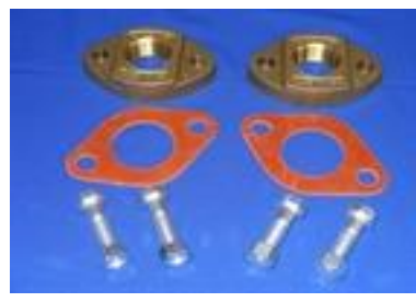
Heavy Duty Meter Flanges