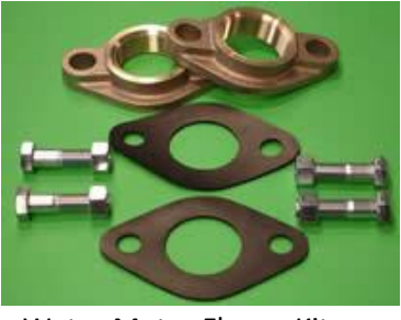
Water Meter Flange Kits