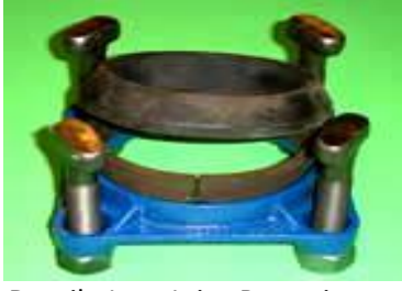
Ductile Iron Joint Restraints