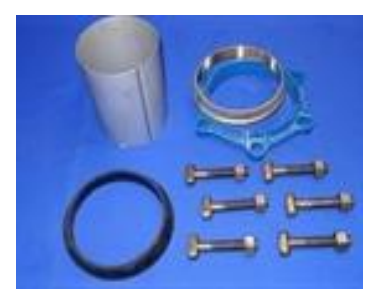
HDPE Joint Restraint Kits