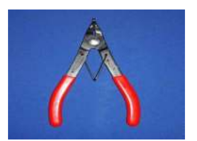
Joint Restraint Pliers