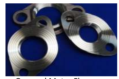
Grooved Meter Flanges