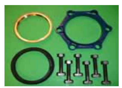
PVC PVCO Joint Restraints