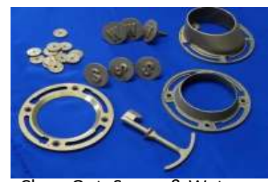
Clean Out, Sewer & Water