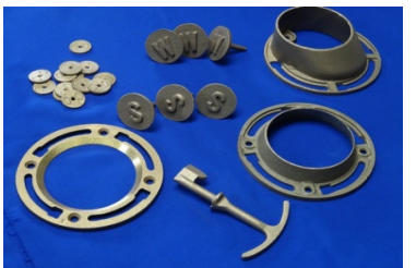
Clean Out, Sewer & Water