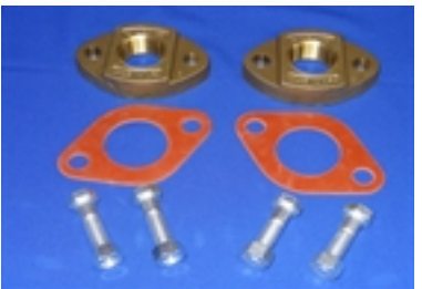
Heavy Duty Meter Flanges