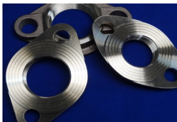
Grooved Meter Flanges