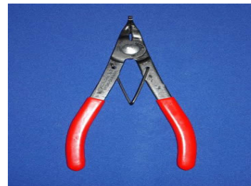
Joint Restraint Pliers