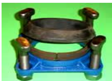
Ductile Iron Joint Restraints