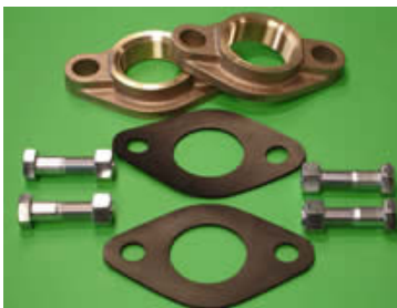
Water Meter Flange Kits