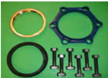
PVC PVCO Joint Restraints