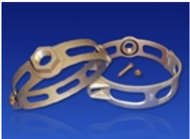
Hinged Service Saddles