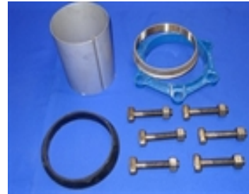
HDPE Joint Restraint Kits