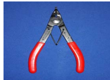
Joint Restraint Pliers