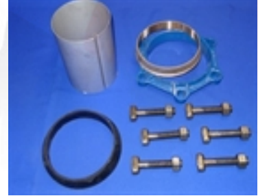
HDPE Joint Restraint Kits