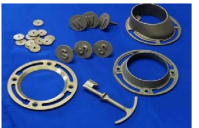
Clean Out, Sewer & Water