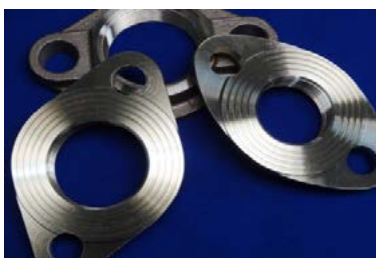
Grooved Meter Flanges